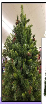
*Picture of actual Christmas Tree prize