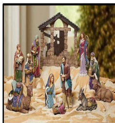
*Handmade 13 piece Nativity set

We now have a code for the website FORMED.ORG - Simply open a web browser and type in: www.formed.org . - Go to the lower right hand side and click on "Register" and follow the prompts. Our IHM code is: CM7TFZ